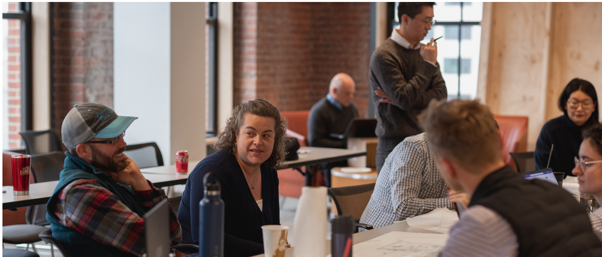
Community partner participation and review is key to the success of the project.

After the Day of Service design charrette, PAYETTE teams compile their work into a final deliverable booklet and presentation. In late January or early February, the deliverables are presented to the community partners at a celebration event.