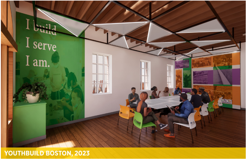
YOUTHBUILD BOSTON, 2023