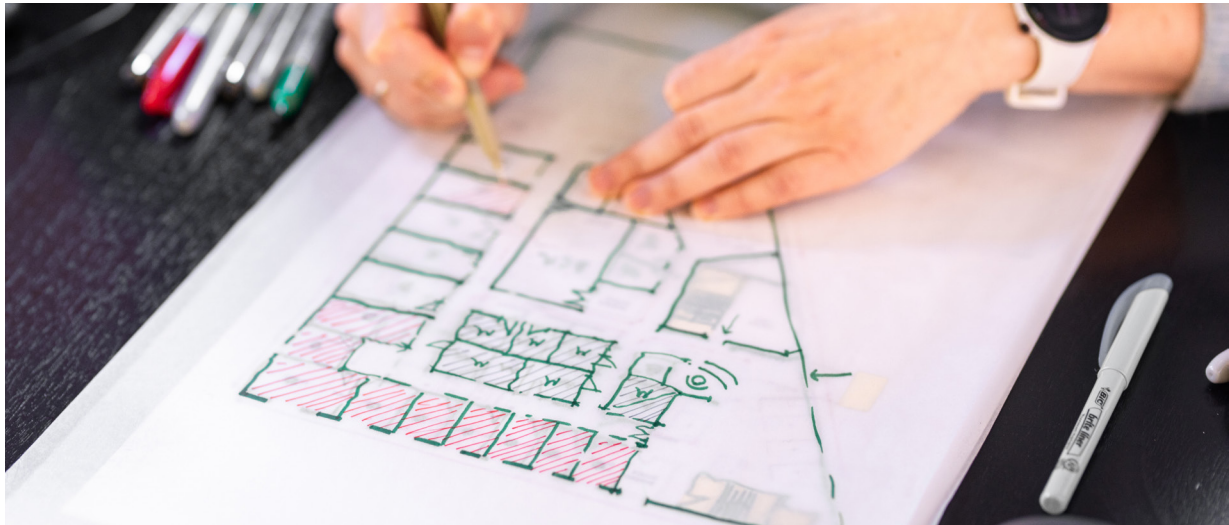
Teams start brainstorming with sketches and diagrams for idea conception.