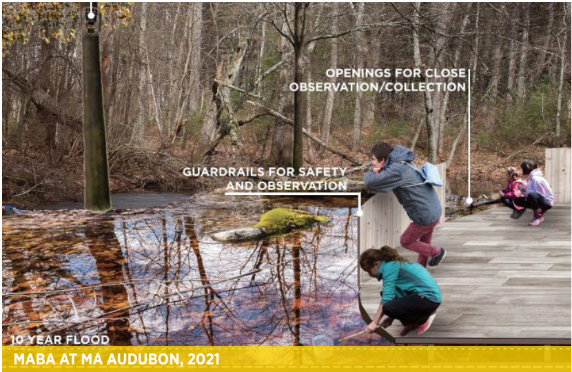
MABA AT MA AUDUBON, 2021