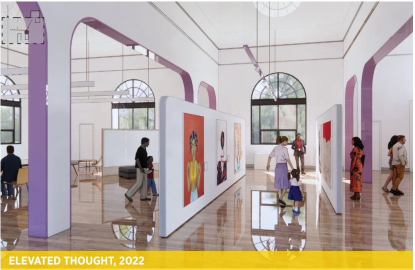
ELEVATED THOUGHT, 2022