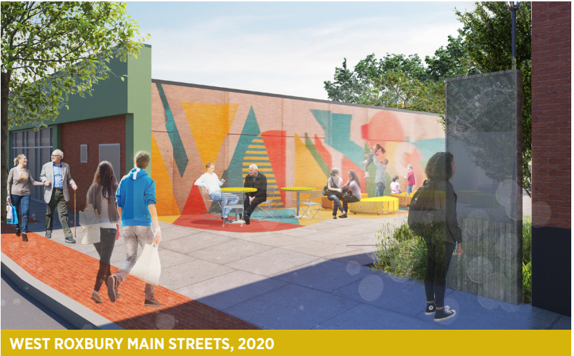
WEST ROXBURY MAIN STREETS, 2020