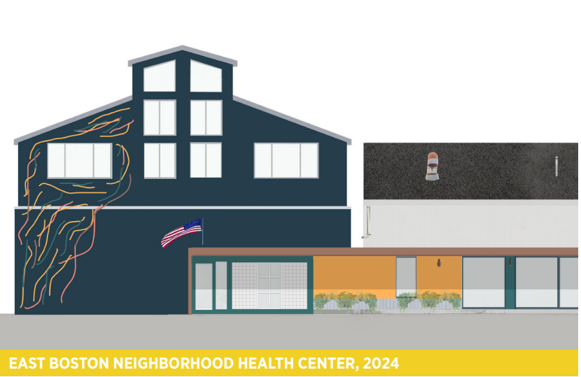
EAST BOSTON NEIGHBORHOOD HEALTH CENTER, 2024