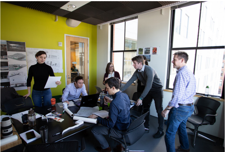
The North Adams Overpass Underway team during the Day of Service full-day charette