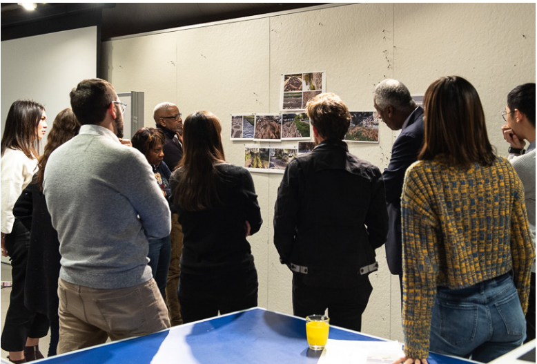
The Greater Grove Hall Main Streets team meets with stakeholders and discusses their site on Blue Hill Avenue