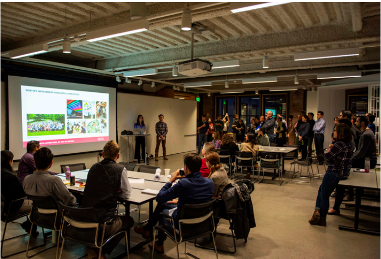
Payette volunteers and community partners gather for final presentations and a celebration of the 2020 Day of Service