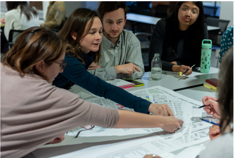
The East Somerville Main Streets team has their second planning meeting with stakeholders

In addition to receiving feedback from our Community Partners, we surveyed Payette staff about their experience participating in Day of Service efforts. Thirty-seven participants completed the survey. The survey showed that the majority (65%) of participants have been working at Payette for five years or less and it was an even split between those who are in leadership positions and those who are not. In addition, 94% of volunteers responded that participating in the Day of Service was a positive experience.